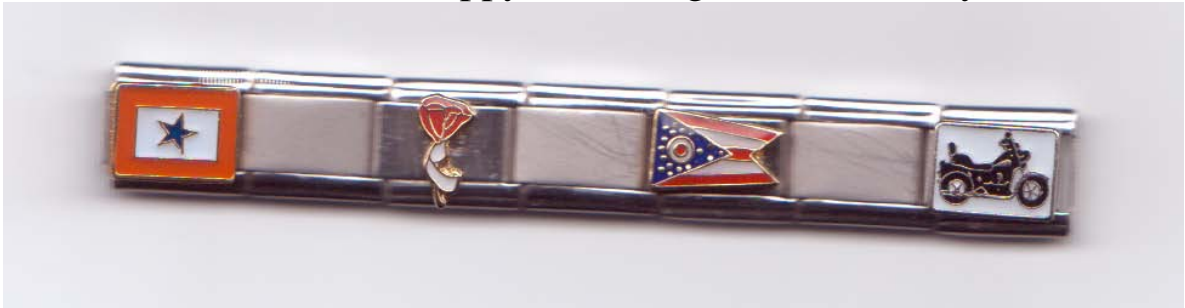
US Navy, Coast Guard, US Marine Corps