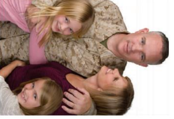
American Legion Auxiliary...helping not only the Veteran but their entire family.

The Military Family Assistance Fund focuses on the needs of our military personnel, young veterans, and their families, a demographic that the American Legion Family must appeal to and be active with to have a sustainable organization. It is through programs such as this that the American Legion Auxiliary can expand it services in our communities. We encourage those that participate as well as grat recipients to have a strong focus on "Paying it forward".