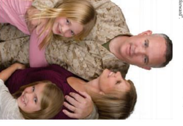
American Legion Auxiliary...helping not only the Veteran but their entire family.

The Military Family Assistance Fund focuses on the needs of our military personnel, young veterans, and their families, a demographic that the American Legion Family must appeal to and be active with to have a sustainable organization. It is through programs such as this that the American Legion Auxiliary can expand it services in our communities. We encourage those that participate as well as grant recipients to have a strong focus on "Paying it