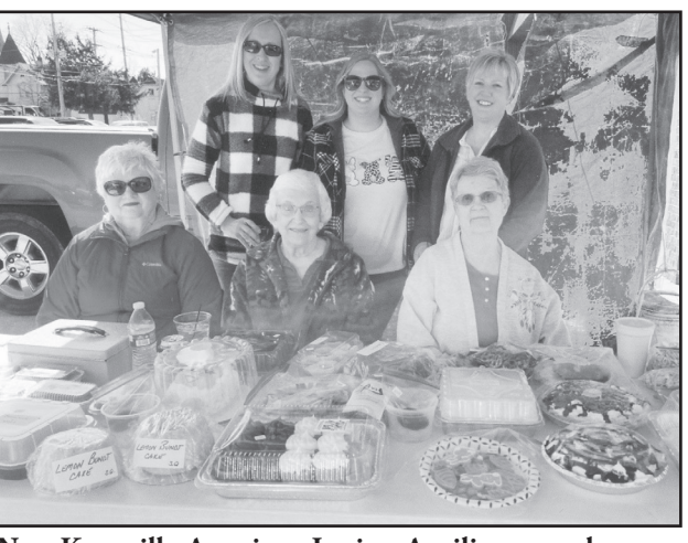
New Knoxville American Legion Auxiliary members are pictured working at the Unit 444 bake sale. The Auxiliary has two bake sales per year and donate the proceeds of one bake sale to veterans in need.