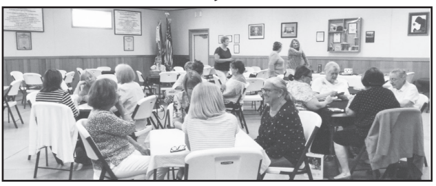
A lady's game night was held Friday May 13, 2022, at the New Knoxville American Legion Post 444.by the Auxiliary. It was the first of two fundraisers to be held to raise money to be split between Honor Flight and Lots for Soldiers. It was a fun event for ladies only. We had donated games for door prizes, snacks and drinks, and a 50/50 raffle. It was a great way to socialize with old friends, family, and neighbors and make new friends.