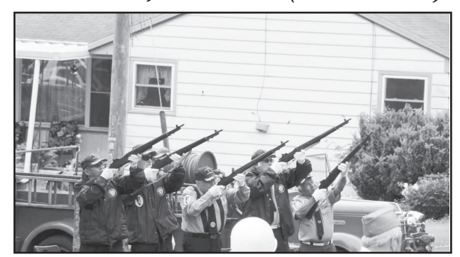
The American Legion family of Post 360, New Paris participated in a Memorial Day Parade.