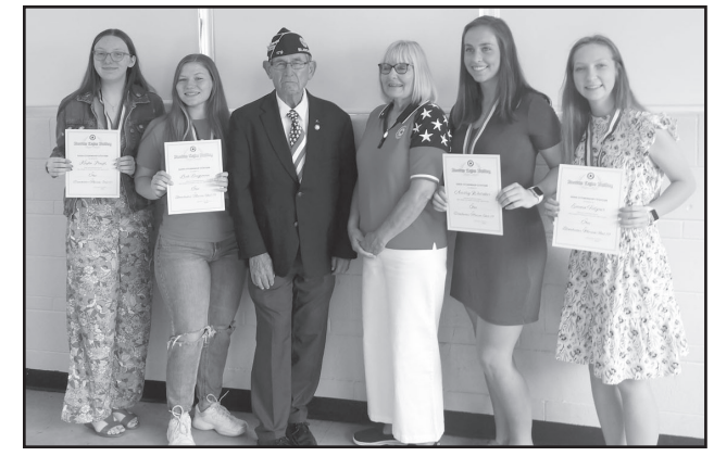
Marion Post 179 & Auxiliary had a combined Boys State/ Girls State reception for those that attended.