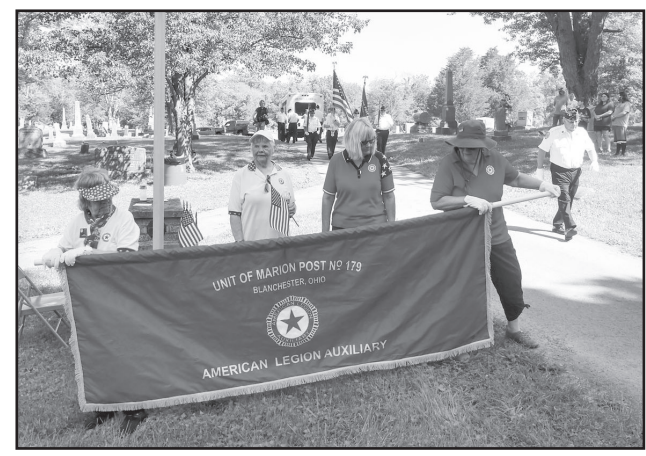
Marion Unit 179 marched and participated in the Memorial Day Parade.