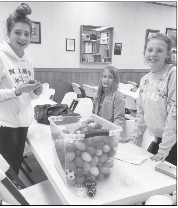
Pictured are junior members for Unit 444 American Legion Auxiliary in New Knoxville packing eggs for the Easter egg hunt. This is one of many projects they help with every year.