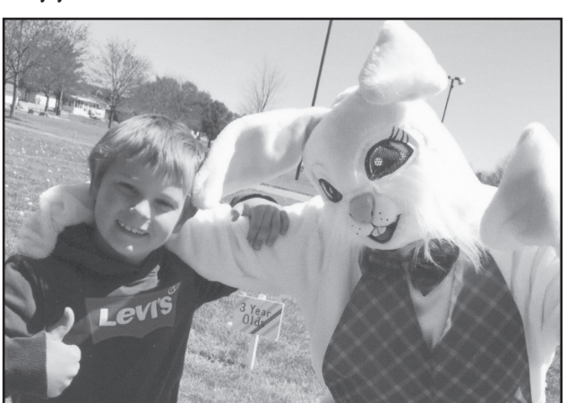
New Knoxville American Legion Auxiliary Unit 444 had an Easter bunny at our egg hunt this year. One of our Auxiliary members was the bunny. It was enjoyed by all the children attending.