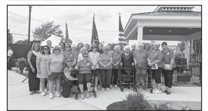
(Continued on Page 18