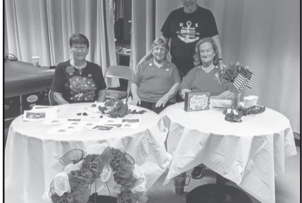
Members of Unit 85 participated in the Memorial Day breakfast for veterans at Post 85 in Newark.