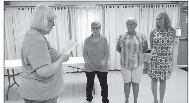
8th District members from Units 11, 21, and 283 attended Department Convention in Cincinnati.