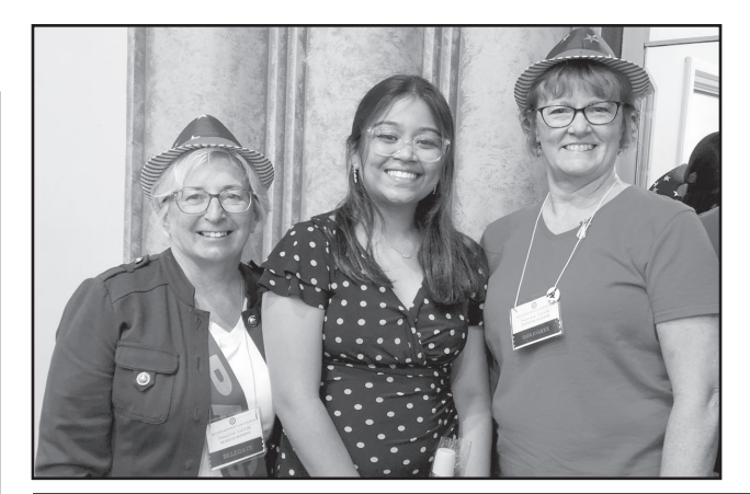
District 4, Unit 615 (Continued)