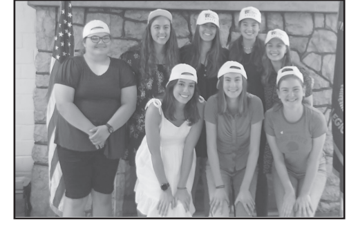
Reception honoring Buckeye Girls State representatives at Unit 79 in Marysville.