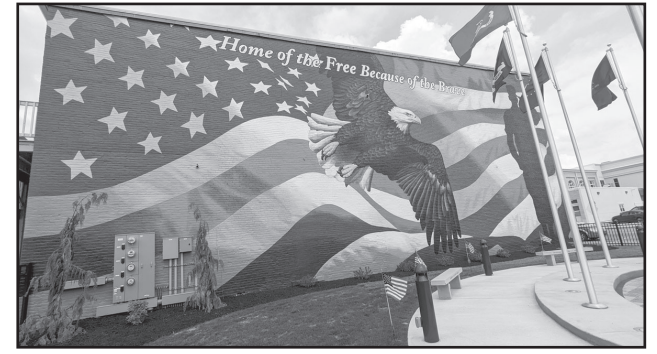
Attica Area Veterans Memorial Park

Seven years ago, several members of American Legion Victory Post 260 in Attica, Ohio wanted to find a place in Attica where all veterans of all branches of the service could be honored. There was an old building, formerly the Attica Hotel and Bar and later, the Fraternal Order of the Eagles, in disrepair. In 2017, the building was razed and turned over to the Village of Attica.